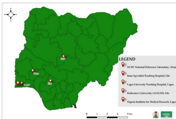
Fig. 2: Map of Nigeria showing COVID-19 testing laboratories