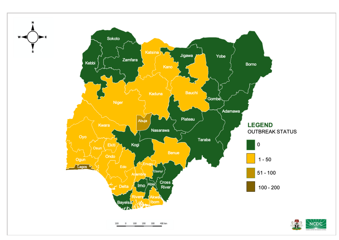
Fig. 1: Map of Nigeria showing the 20 states affected by COVID-19