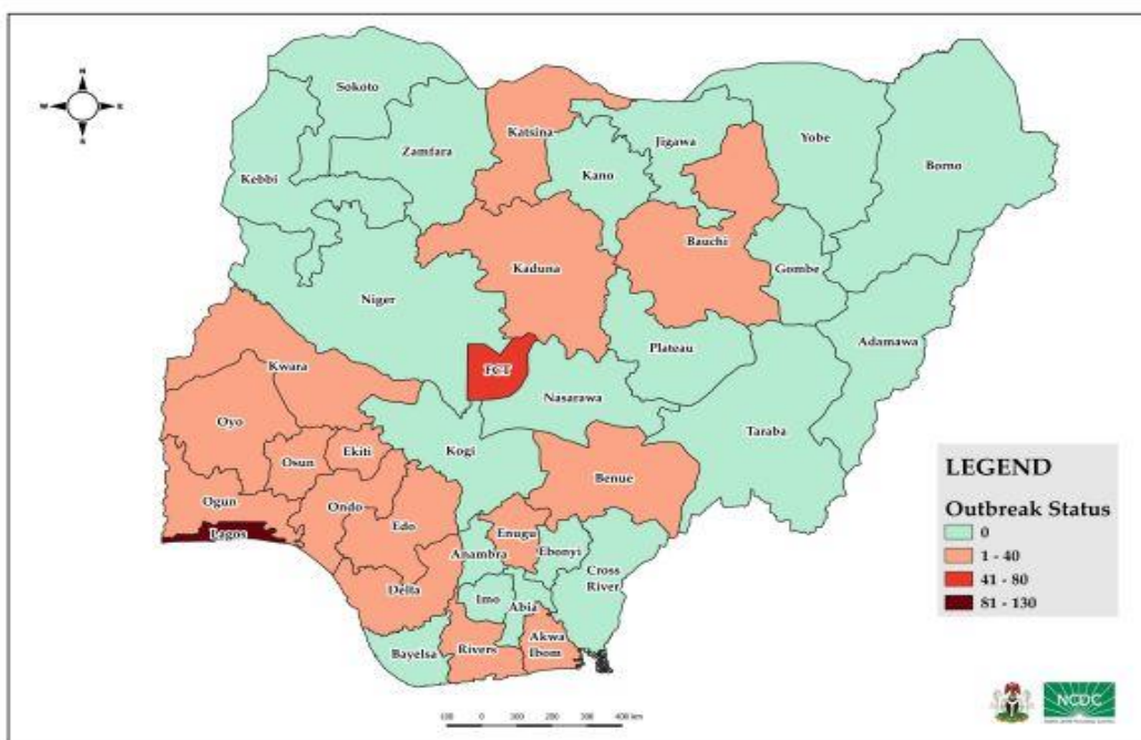
Fig. 1: Map of Nigeria showing the 17 states affected by COVID-19