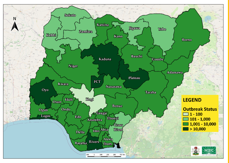
Fig 2. Distribution of cumulative cases as of Epi Week 15, 2022