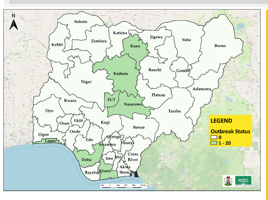
Fig 1. Distribution of cases (Epi Week 15 only)