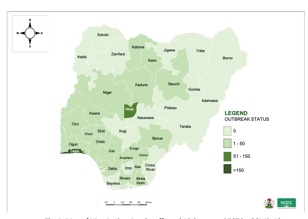
Fig. 1: Map of Nigeria showing the affected 19 States and FCT by COVID-19