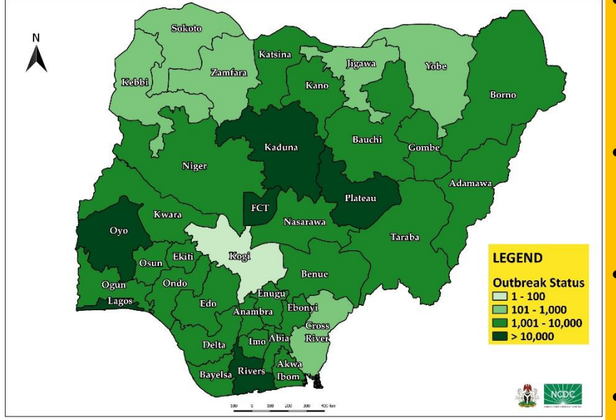
Fig 2. Distribution of cumulative cases as of Epi Week 6, 2022