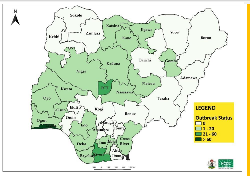
Fig 1. Distribution of cases (Epi Week 6 only)