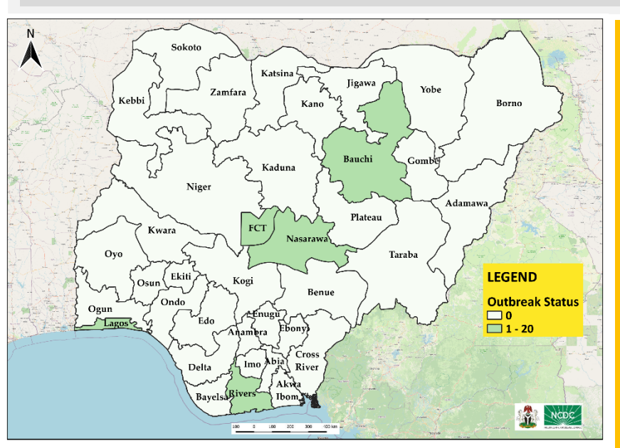
Fig 1. Distribution of cases (Epi Week 16 only)