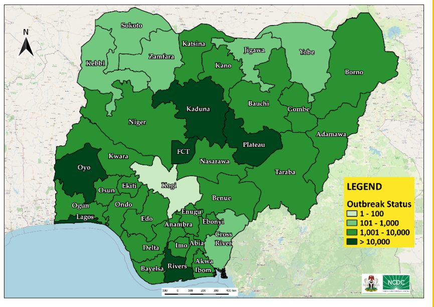
Fig 2. Distribution of cumulative cases as of Epi Week 16, 2022