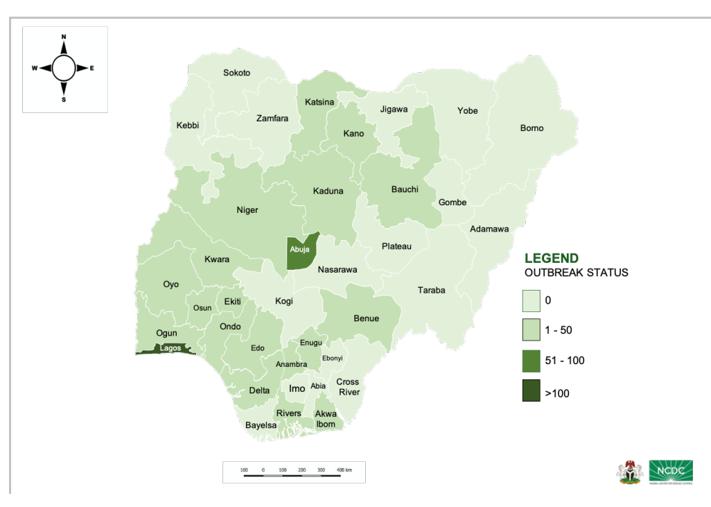
Fig. 1: Map of Nigeria showing the affected 19 States and FCT by COVID-19