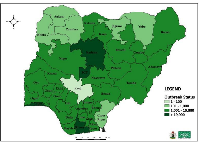
Fig 1. Distribution of cases (Epi Week 47 only)