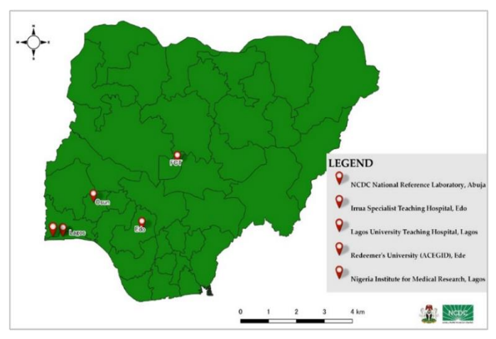
Fig. 1: Map of Nigeria showing COVID-19 affected States