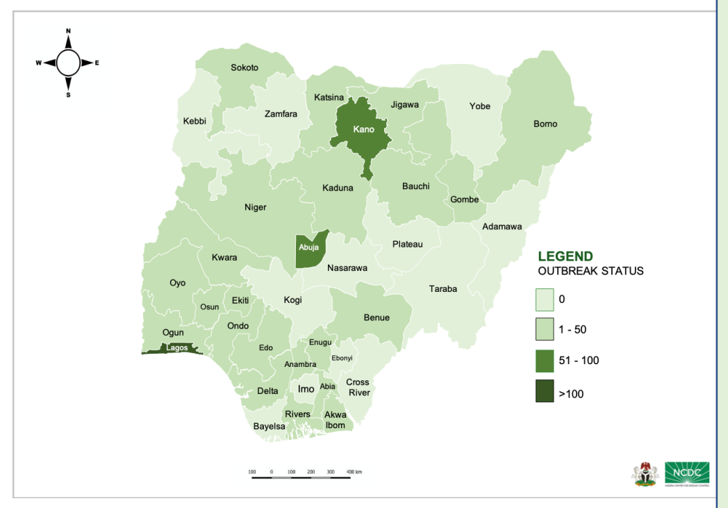
Fig. 1: Map of Nigeria showing the affected 24 States and FCT by COVID-19