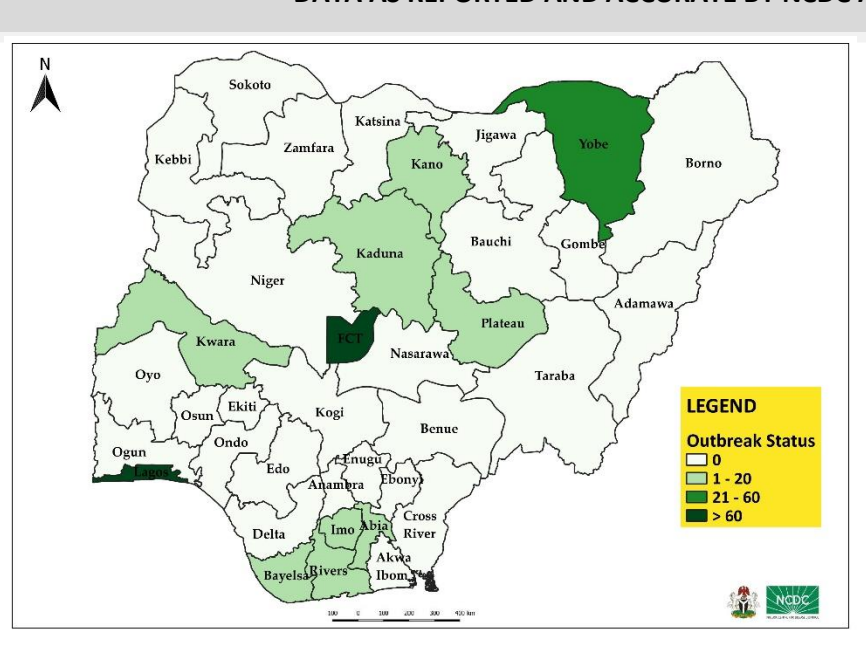
Fig 1. Distribution of cases (Epi Week 10 only)