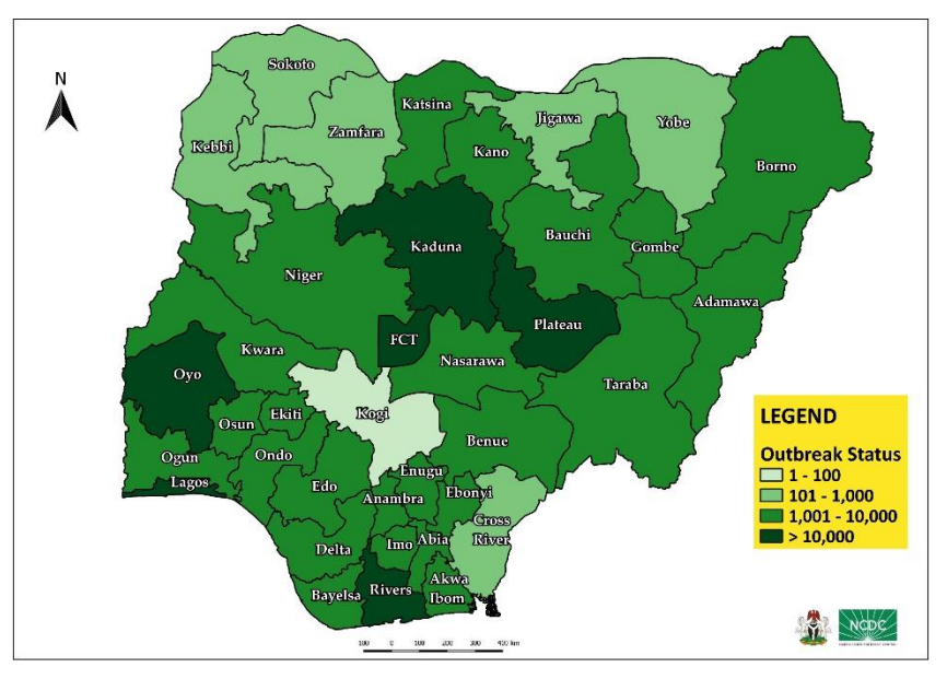
Fig 2. Distribution of cumulative cases as of Epi Week 10, 2022