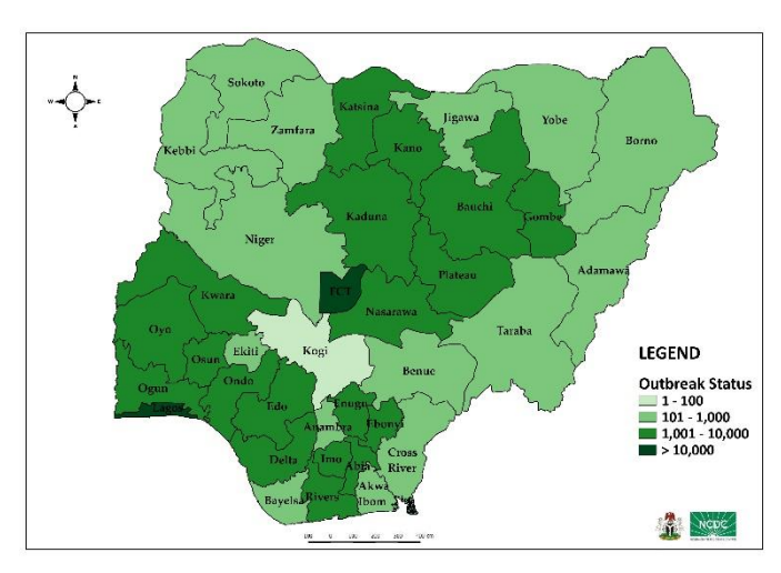
Fig 1. Distribution of cases (Epi Week 4 only)