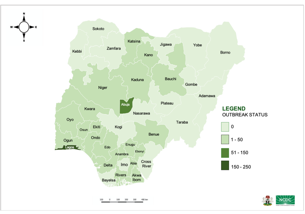
Fig. 1: Map of Nigeria showing the 20 states affected by COVID-19