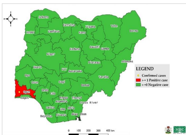
Figure 1: Map of Nigeria showing COVID-19 affected State