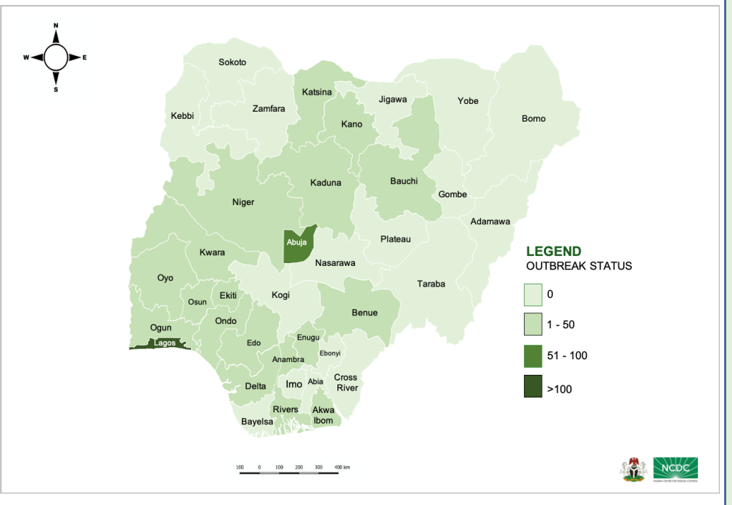
Fig. 1: Map of Nigeria showing the affected 19 States and FCT by COVID-19