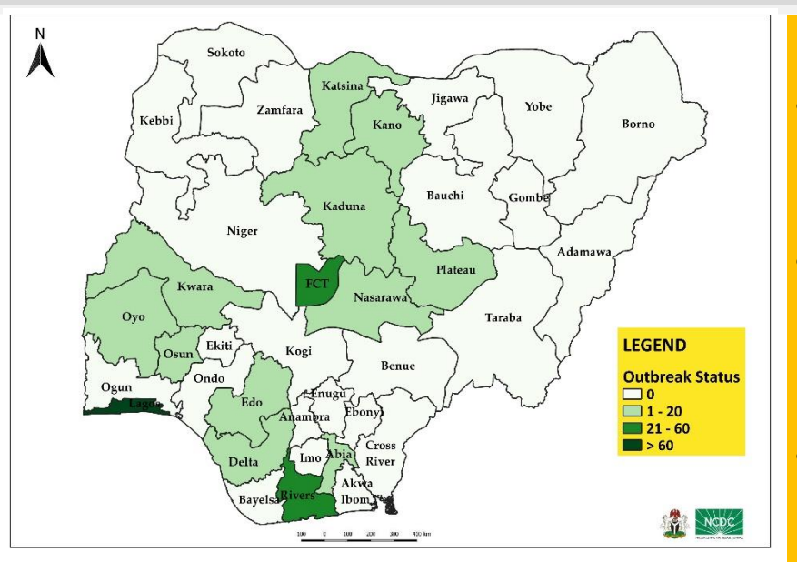
Fig 1. Distribution of cases (Epi Week 08 only)