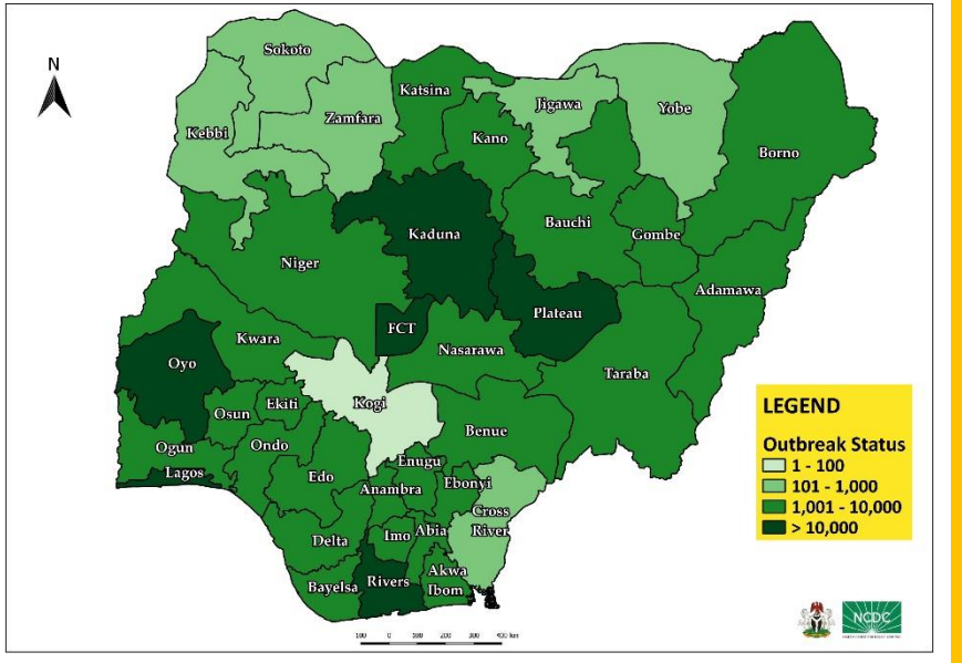
Fig 2. Distribution of cumulative cases as of Epi Week 08, 2022