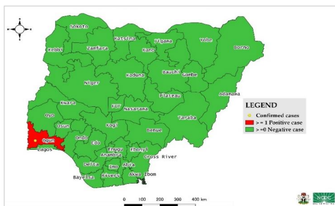
Figure 1: Map of Nigeria showing COVID-19 affected State

*One new confirmed case is an asymptomatic contact to the index case