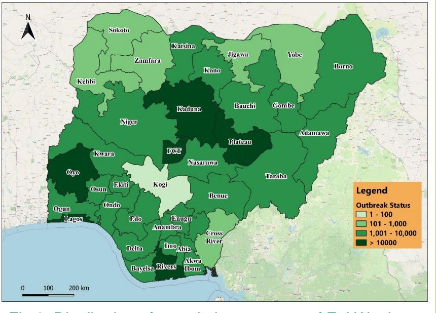
Fig 2. Distribution of cumulative cases as of Epi Weeks 17&18, 2022