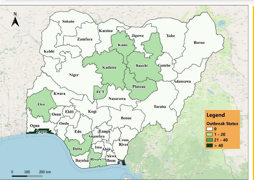
Fig 1. Distribution of cases (Epi Weeks 17&18, 2022 only)