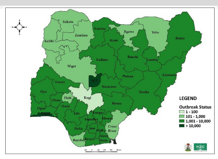
Fig 1. Distribution of cases (Epi Week 29 only)