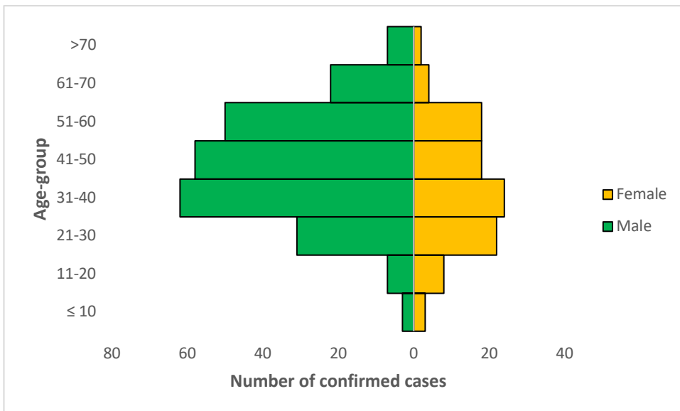
Fig. 4: Age-Sex distribution of Confirmed Cases (wk9 – wk16)