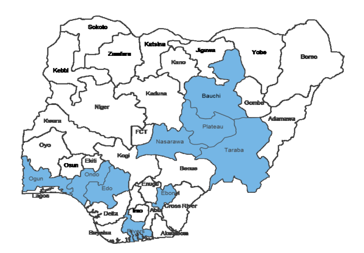
Figure 1. States with confirmed cases as at Feb. 3, 2017