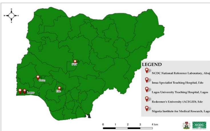
Figure 2: Map of COVID-19 testing laboratories in Nigeria