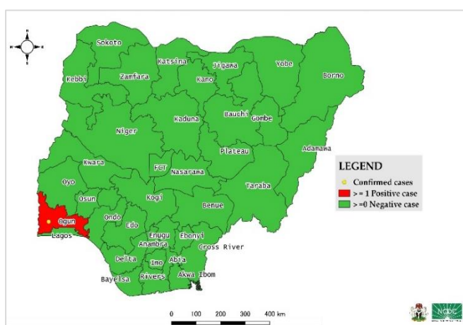
Figure 1: Map of Nigeria showing COVID-19 affected State

*One new confirmed case is an asymptomatic contact to the index case